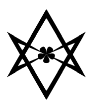
Hexagram of the Beast Unicursal Hexagram

"The Universal Jewish Encyclopedia declares that the SIX-POINTED STAR...according to the Rosicrucians...was known to the ancient Egyptians."