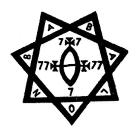
Seal of the A.'.A.'.

Seven letters hath Her holiest name; and it is: