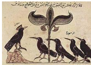
A page from the Arabic version of Kalila wa dimna dated 1210 ev illustrating the King of the Crows conferring with his political advisors.

Pan and the Beast seem also connected to the ‘beast fable’ or ‘beast epic’ tradition of the ancient world. These were short stories and poems that used animals allegorically to reflect human behavior; subjecting moral weaknesses to critical scrutiny. This seems incorporated into Kalila-Oumbri that seems to reflect an Arabic beast fable called Kalila and Dimna.